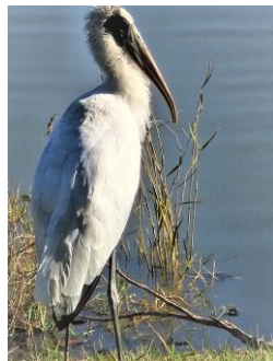
Woodstork at our Pond