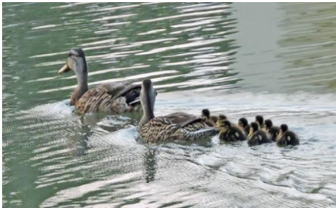
Our Ducks and Kids at Edwards Pond

Nature makes sure that spring produces many baby animals all around us. Look and you will see.