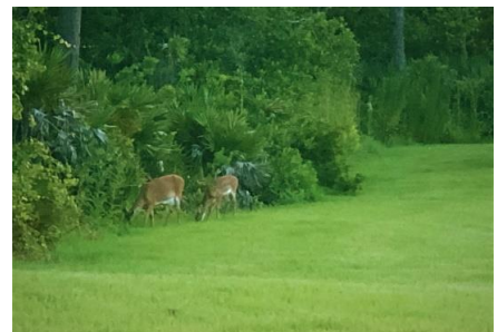
Deer along our Back Road