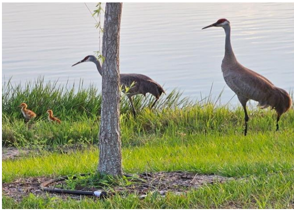
Sand Hill Cranes and babies