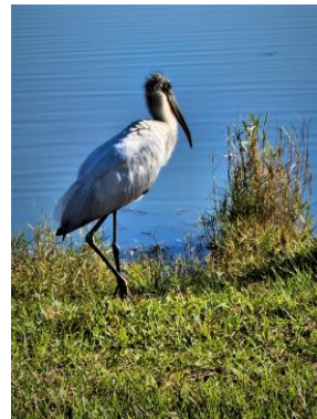
Woodstork looking for Lunch