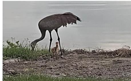
Daddy Long Legs Sand Hill and Chick